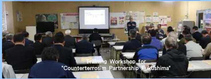
Training Workshop for "Counterterrorism Partnership Fukushima"

In order to prepare for large-scale security activities associated with Tokyo Olympic games in 2020, we tighten security at important facilities and public transportation such as nuclear power plants and railways, and conduct various anti-terrorism training in collaboration with related agencies. Furthermore, we promote to take public and private measures against terrorism in cooperation with explosive material distributors, hotels, rent-a-car companies, Internet cafes, etc..