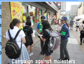
Campaign against molesters

Our priority is to ensure victims' safety with full consideration for victims and their family in stalker incidents, domestic violence, and abuse or missing cases of children or elderly people. Furthermore, we promote crime prevention activities with relevant agencies or groups to protect children and woman from crimes.