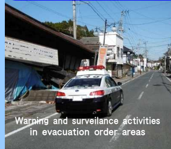
Warning and surveillance activities in evacuation order areas