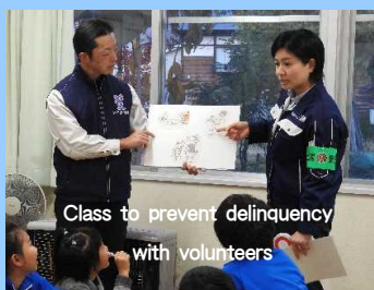
Class to prevent delinquency with volunteers

Furthermore, we crack down on crimes which are harmful to child welfare, and deal with child abuse which has become a social problem.