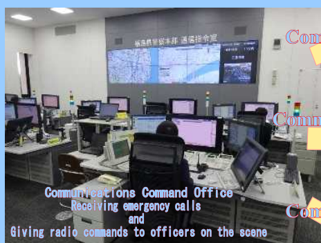
Communications Command Office Receiving emergency calls and Giving radio commands to officers on the scene