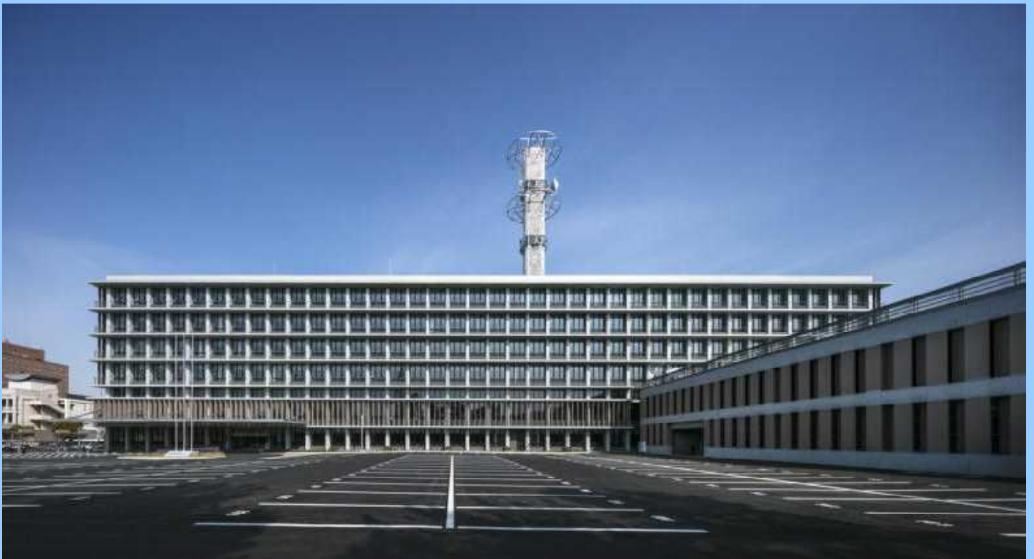
Fukushima Prefectural Police Headquarters