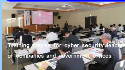
Training course for cyber security leaders of companies and government offices

In order to create environment where everyone can use the Internet in peace, we intensify crackdowns on vicious and sophisticated cybercrime such as unauthorized access with the promotion of PR activities under the cooperation between the public and private sectors for the safety of the Internet usage.