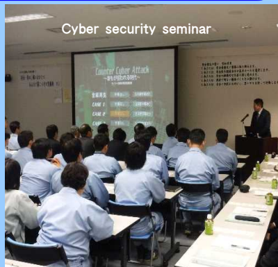
Cyber security seminar

Cyber-attacks on domestic and foreign government agencies may cause serious damage to countries' security and risk management. In order to prevent or minimize the damage caused by the cyber-attacks, we share necessary information on security with critical infrastructure companies, and other related groups, and conduct joint training or other activities keeping occurrence of cyber-attacks in mind.