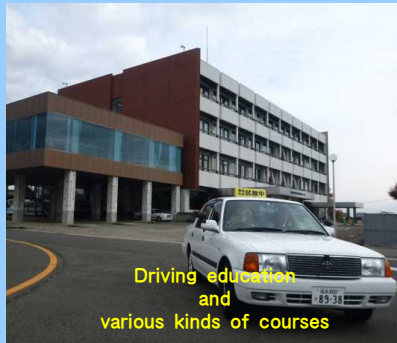
Driving education and various kinds of courses

In order to help drivers to enhance a sense of traffic safety, safety driving knowledge and driving skills, we hold traffic workshops for any driver who get a driver license first or renew it, based on the reality of current traffic accidents. Furthermore, we actively receive consultation from senior drivers and their family and give advice and instruction to them, which are necessary to keep safety driving.