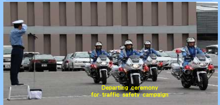
Departing ceremony for traffic safety campaign

In order to protect citizens of our prefecture from tragic traffic accidents, the police promote traffic safety campaigns in collaboration with communities. Therefore, in corporation with related agencies or groups, traffic volunteer groups, etc., we conduct various on-the-street activities such as a traffic safety campaign in each season.