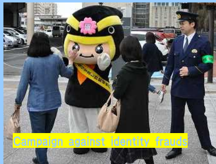
Campaign against identity frauds

In corporation with relevant agencies or groups, we engage in PR and educational activities against Identity frauds, which includes street campaign, crime prevention lectures, etc..