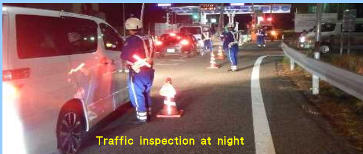
Traffic inspection at night

We strengthen the traffic regulations against vicious and dangerous traffic violation such as drunk driving, driving without permission, obstructing pedestrians on a crosswalk and so on to prevent serious traffic accidents or traffic crimes. In addition to that, we promote careful and accurate traffic investigation to find out the truth of traffic accidents and crimes and get the speedy solutions of them.