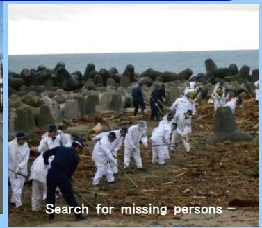
Search for missing persons

We keep careful watch day and night on areas to which evacuation orders have been issued, typhoon disaster areas, and so on to ensure the security and safety around these areas. In addition, we continue to search for missing persons in the Great East Japan Earthquake.