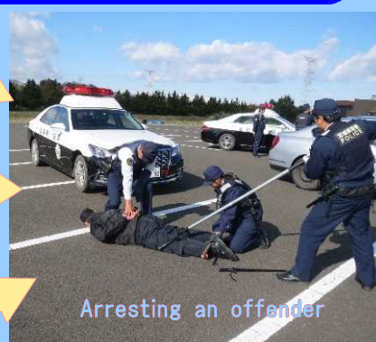
Arresting an offender

When an accident or crime occurs, we develop our fast and accurate early-stage police activities maximizing the effect of police cars, police helicopters, etc., under the centralized control of the communications Command Office in an effort to catch criminals early.