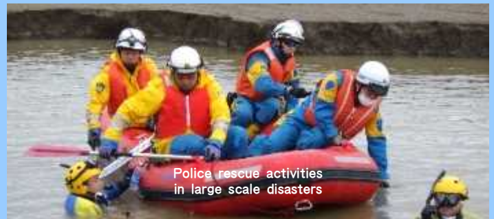
Police rescue activities in large scale disasters

In order to prepare for large-scale disasters, we make continuous efforts to conduct practical training to upgrade the ability of each unit member to cope with disasters. When East Japan typhoon in 2019 "Typhoon No.19" caused damage, the unit members were sent to the disaster areas for the rescue operation.