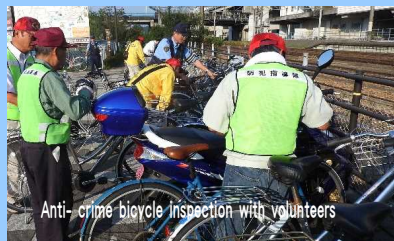
Anti-crime bicycle inspection with volunteers

We conduct anti-crime patrols and inspections, and advertising campaigns on the street in corporation with and volunteer groups for the purpose of establishing local communities where all residents of Fukushima prefecture can live with peace of mind.